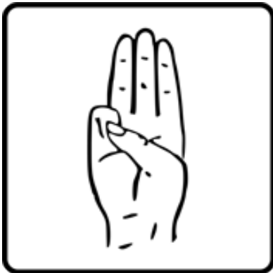
Promise & Law