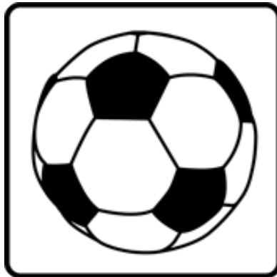
Games & Activities